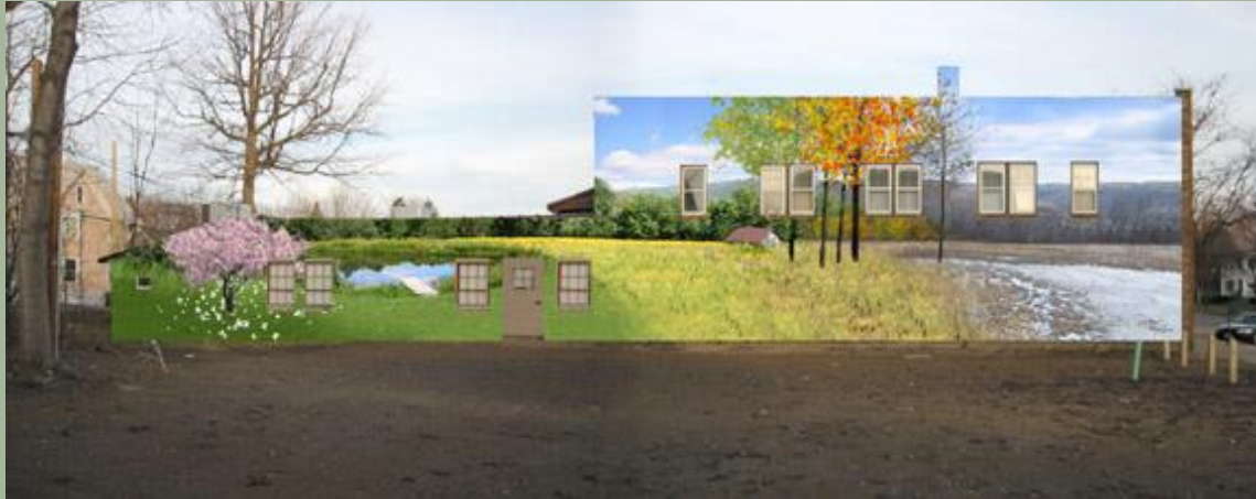
One idea for our proposed mural

As part of our plan to develop the vacant lots adjacent to our building, a mural concept has been proposed for our west wall with a target date of early this fall. Between now and then we will be pursuing assistance from the Council on the Arts as well as seeking a lot of community input and participation.