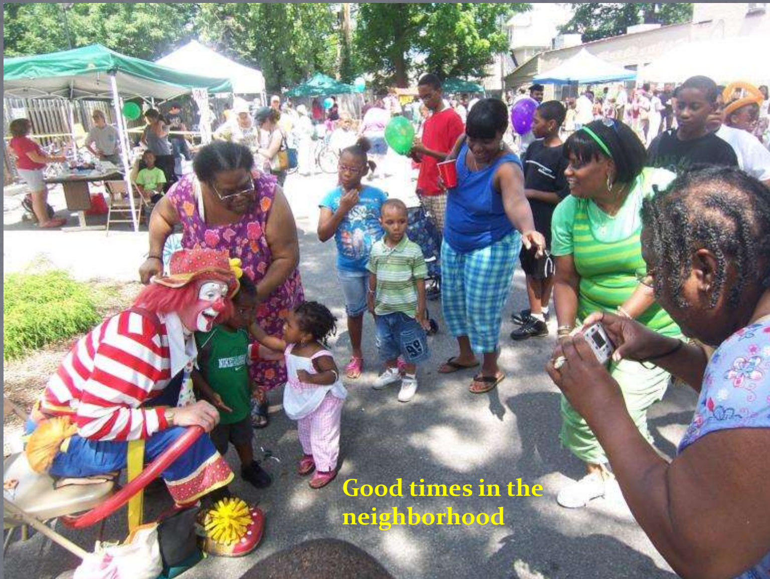
Good times in the neighborhood